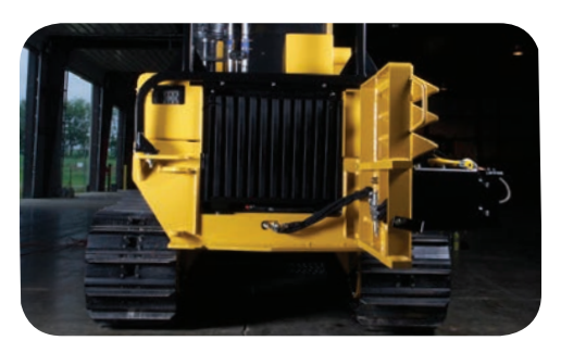
Swing Open Rear Door