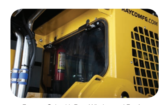
Forestry Cab with Rear Window and Rooftop Escape Hatches