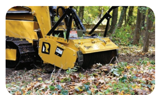
Predator Mulcher Head with Variable Displacement Motor

When you go into the woods, you need a machine you can count on. You need a mulching machine that's purpose-built from the ground up to be the most productive and reliable in a forestry application. The C100LGP is that machine. It's equipped with a 99.2 hp Kubota engine and Rayco's exclusive Super Flow, closed loop, hydraulic system to maximize power delivery to the Predator mulcher head. The patented, elevated cooling design keeps vital engine and hydraulic components within their temperature limits in the harshest climates. This Rayco exclusive cooling design makes radiator maintenance easier and extends service intervals.