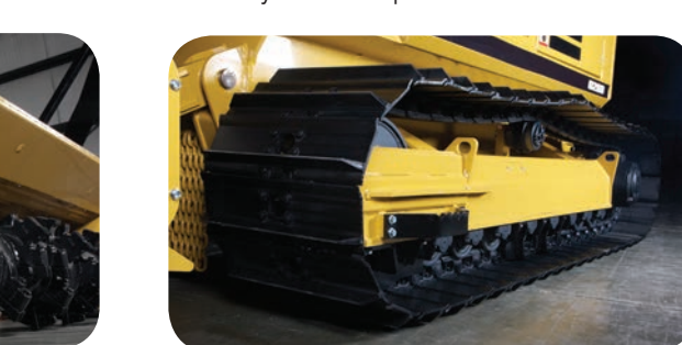
Heavy Duty Undercarriage with 2-Speed