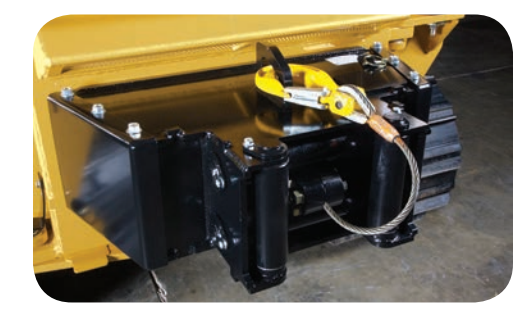
Hydraulic Rear Winch