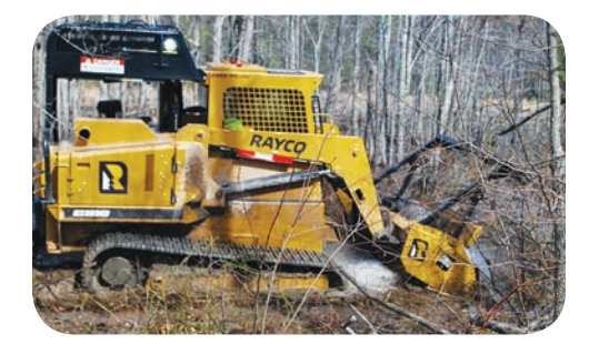
Rayco Exclusive Elevated Cooling System