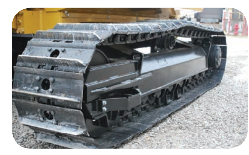
Heavy Duty Undercarriage with 2-Speed