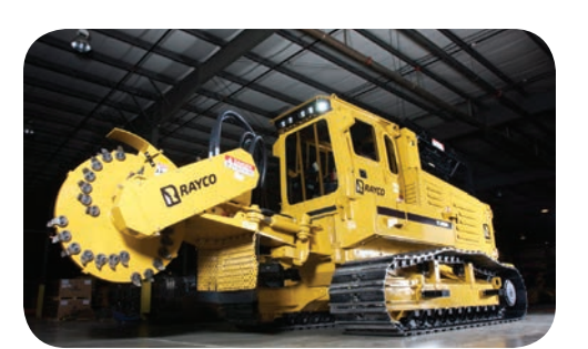
T360 with Hydra Stumper Stump Cutter Head

Heavy duty track chain will accommodate track shoe widths from 24 to 30-inches wide.