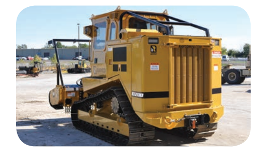
Hydraulic Rear Winch