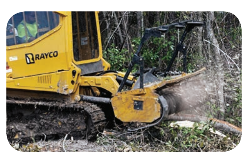
Powerful 200 hp Isuzu Diesel Engine