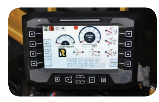
Large LCD Display that Includes a Rearview Camera