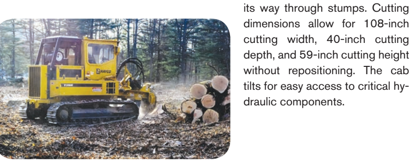
Elevated Cooling Design with Hydraulic Coolers Mounted in Limbriser

friendly cabin is fully sealed and climate controlled with A/C, heat, LCD control panel, joystick controls, and a heated suspension seat. The T260 utilizes a 40-inch diameter by 3-inch thick cutter wheel with 36 Monster Tooth cutter tools to power