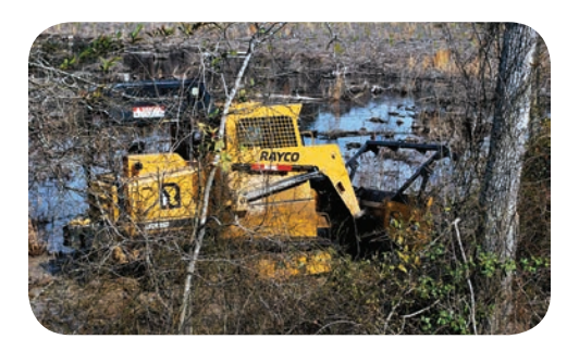
Powerful Kubota 99hp Turbo Diesel Engine