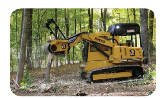
Rayco Exclusive Elevated Cooling System