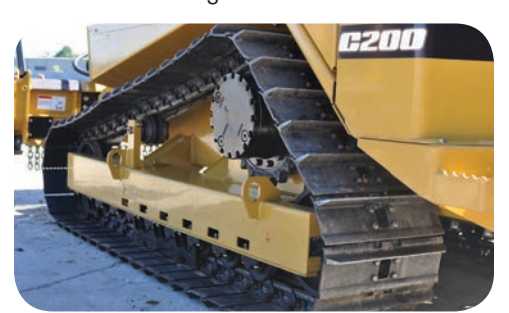
EASY CLEAN - Hi-Track Steel Undercarriage with 2-Speed Travel

The C200 mulcher is a powerful, purpose-built mulcher that packs 200hp in a compact package. A 200hp Isuzu diesel provides more horsepower than any other machine in its class with legendary Isuzu reliability. The C200's compact size and weight allow for easy transportation to and from the jobsite. Operators appreciate the quiet and comfortable cabin, reducing fatigue after a day on the job. The high-backed and heated suspension seat offers excellent visibility and a smooth ride, while a quiet interior and large LCD information center provide performance data. The C200's hi-track steel undercarriage cleans easily, and features Rayco's exclusive track tension monitoring system that alert the operator of over-tension situations and allows for fast and accurate tensioning of the track chains. The C200 utilizes Rayco's Predator mulcher head with dual drive motors, 36 carbide tipped teeth, and a 6-ft cutting width.