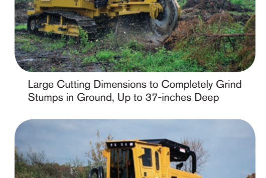
Predator Mulcher Head Uses Variable Displacement Motors to Maximize Productivity