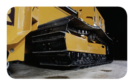
Heavy Duty Steel Undercarriage with 2-Speed Final Drives