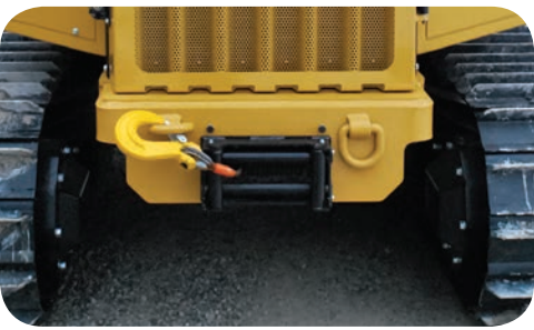
Hydraulic Rear Winch