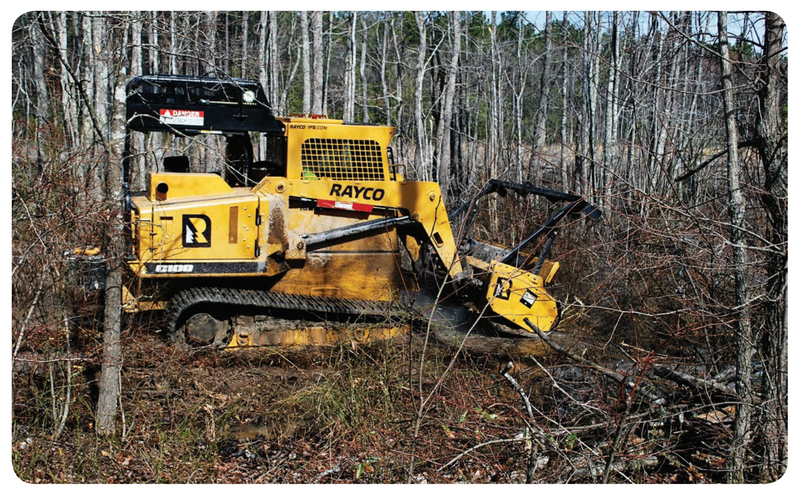
Rayco's new C100R Forestry Mulcher is the answer if you're looking for a purpose-built mulcher but need the versatility of rubber tracks. Our customers demanded a mulcher that was capable of crossing roadways and sensitive turf but still had the power and in-woods characteristics of a dedicated forestry machine. The C100R answers that call. It rides on a 17.7-inch wide steel-imbedded rubber track. A reliable, 99 hp Kubota diesel engine supplies power, while Rayco's exclusive Super Flow, closed loop hydrostatic system delivers mulching power not found in ordinary Compact Track Loaders. Purpose built for mulching, the C100R features a heavy duty rear door, hydraulic winch, and Rayco's exclusive elevated cooling design, which places engine radiators in both the rear of the engine compartment and in the limbriser for maximum cooling performance in the harshest climates. The cab is certified ROPS/OPS/FOPS with escape hatches in the roof and rear window.