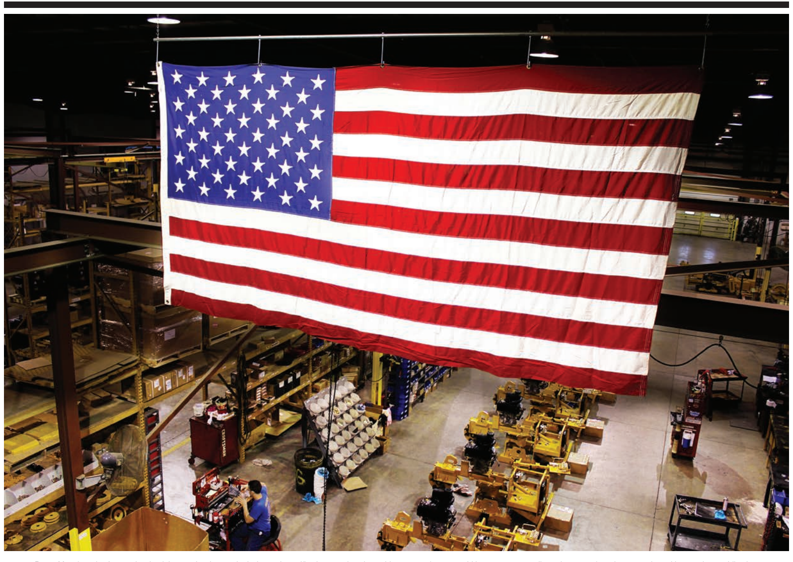
Rayco Manufacturing Inc. retains the right to make changes in design and specifications; engineering; add or remove features; add improvements; or discontinue manufacturing at any time without notice or obligation