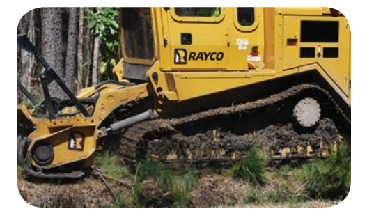
Exclusive Remote Track Tension Monitoring System