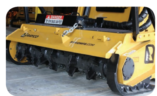
Predator Mulcher Head with Variable Displacement Motor