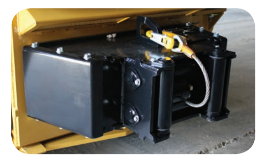
Hydraulic rear winch