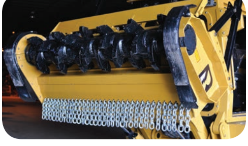
Predator Mulcher Head with Variable Displacement Motor