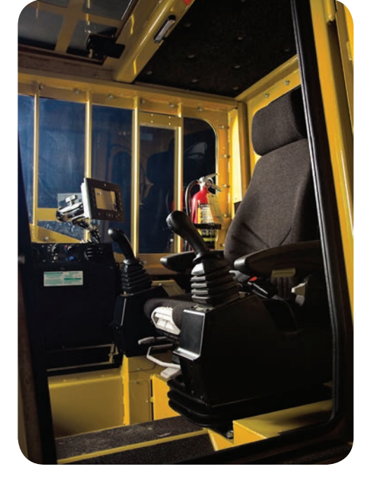
Forestry Cab with Rooftop Escape Hatch and Heated, Suspension Seat