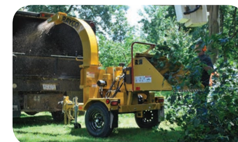
Versa-Feed Automatic Feed Control