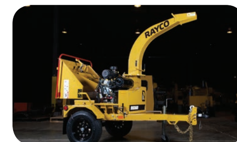
Available with 25 hp Kohler or 35 hp Vanguard Engine