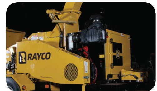
Powerful 160 hp Cummins Engine

Note: *Tier 4i - US only *Tier3i - Non-US