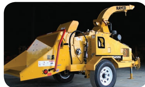
130 hp GM Gasoline Engine