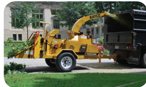
89 hp GM Gasoline Engine