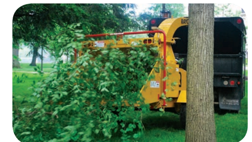
Hydraulic Feed Wheel Lift and Crush 12-inch x 20-inch Infeed Opening