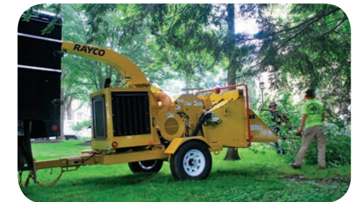
Kubota Diesel Power

*Please note that the RC1220-100 is not available in the U.S. at this time