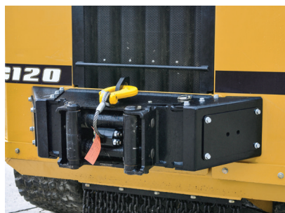
Hydraulic rear winch with 12,000-pound capacity.