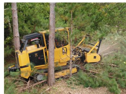
Purpose-Built Forestry Mulcher